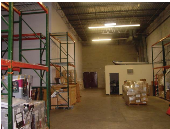
22' CLEAR CEILING HEIGHT