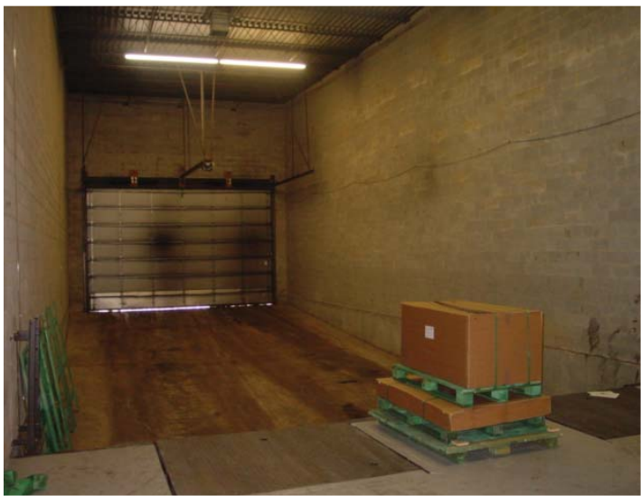
TWO SHARED TRUCK LEVEL DOCKS